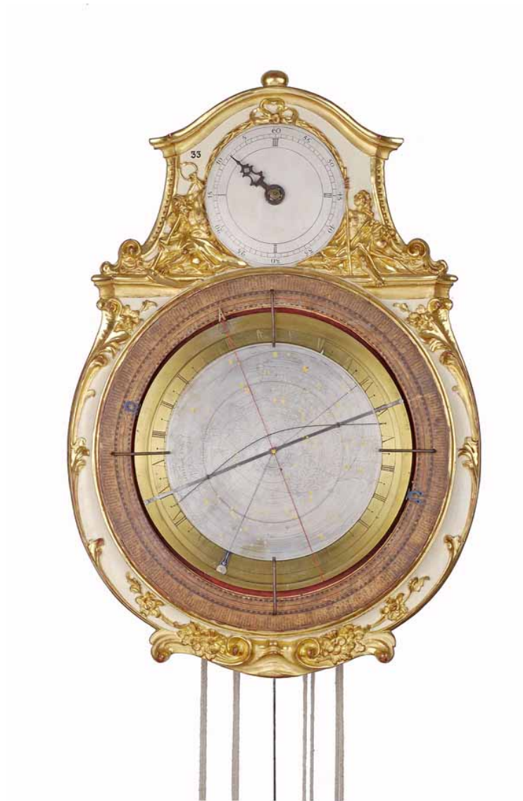
Figure 26.1: Thaddäus Rinderle's clock (1787).