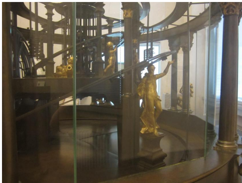
Figure 25.4: Detail of some of the figures inside Nestfell's machine.