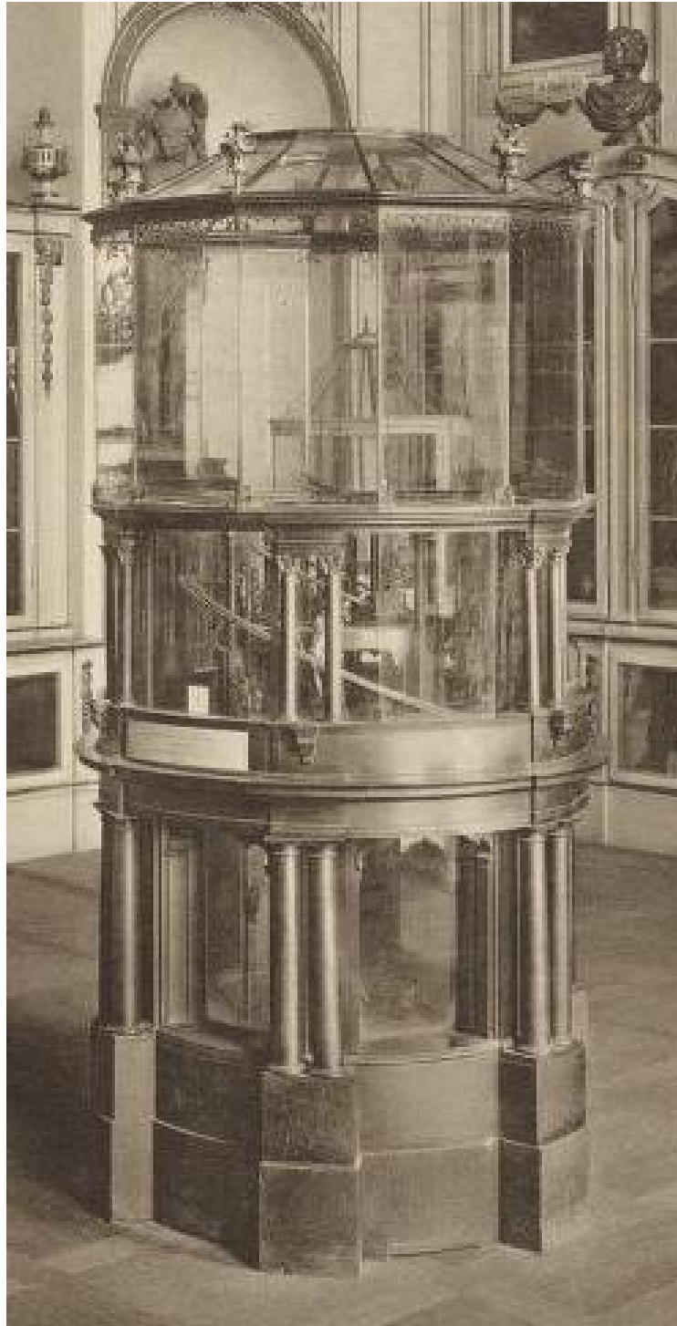
Figure 25.2: Nestfell's machine in 1902 (detail). (source: [18, pl .XLVI])