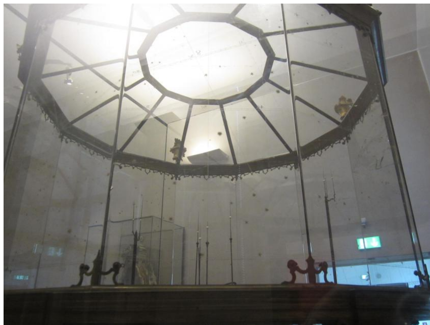
Figure 25.6: The top of the case of Neßtfell's machine.