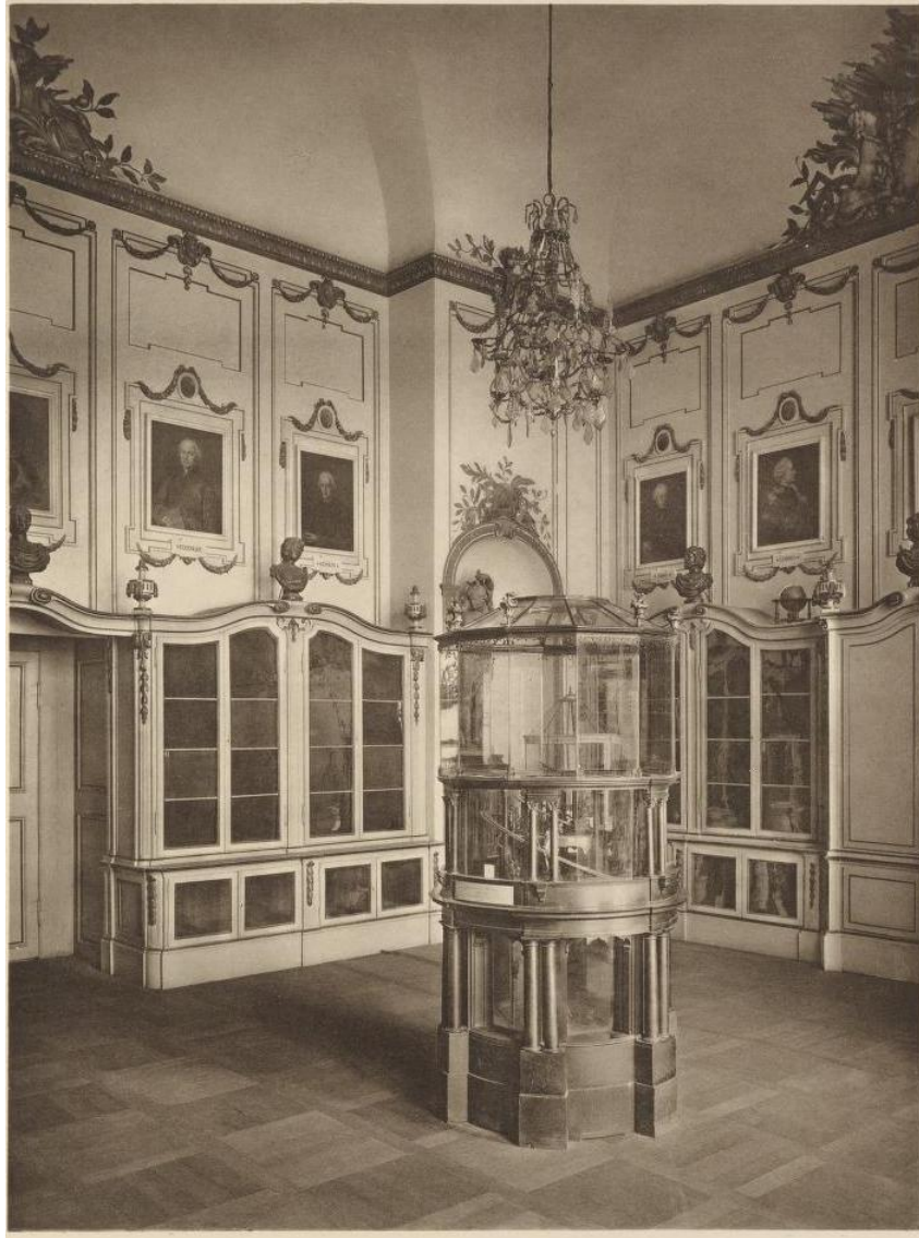
Figure 25.1: The location of Nestfell's machine in 1902.