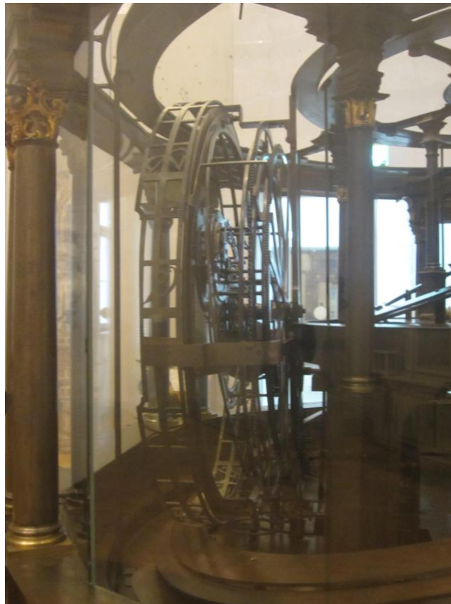
Figure 25.5: The gears from the front dial of Nestfell's machine seen from the side.