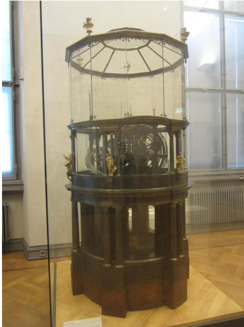
Figure 25.3: Nestfell's machine as it appears today.