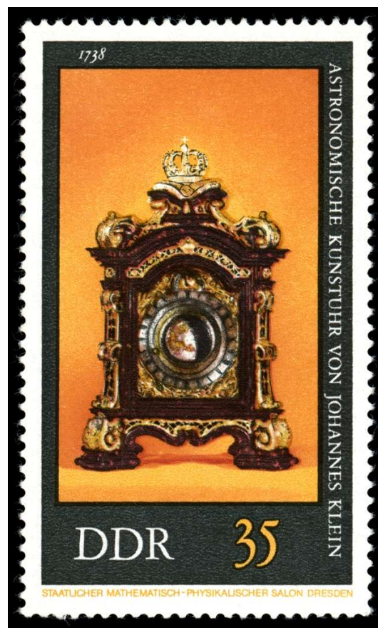
Figure 21.3: Klein's 1738 clock on a 1975 stamp from the DDR.