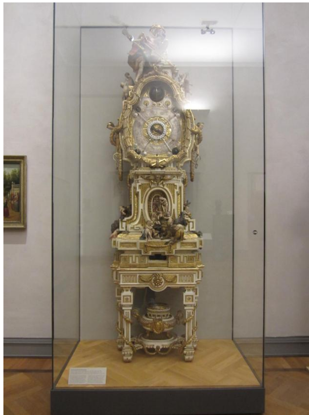
Figure 3.1: Pater Aurelius' clock in Munich.