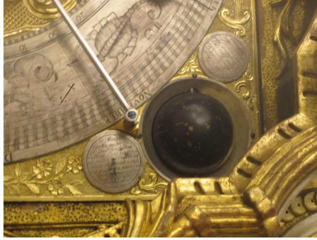
Figure 3.6: The lower right part of the dials of Pater Aurelius' clock in Munich, with the lunar sphere. (photograph by the author)

This is an approximation of the synodic month, but also a rather bad one. The same value is given by Oechslin.