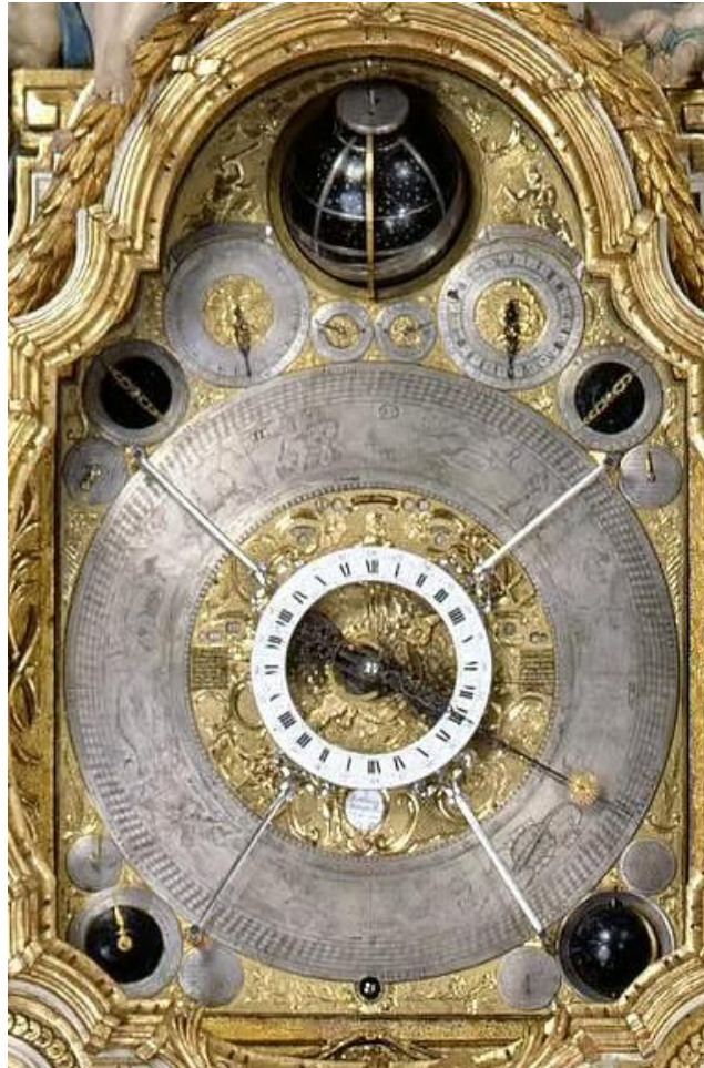
Figure 3.3: The dials of Pater Aurelius' clock in Munich.