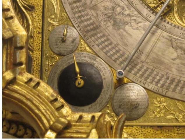
Figure 3.4: The lower left part of the dials of Pater Aurelius' clock in Munich.

This arbor makes one turn clockwise in two hours.