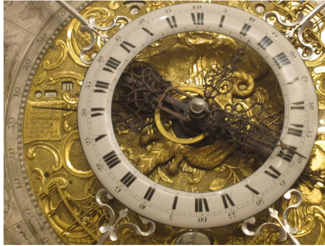
Figure 3.5: The 24-hour dial on Pater Aurelius' clock in Munich.

The time is shown by two hands, one for the hours (on twice 12 hours) and one for the minutes (on twice 60 minutes). The use of such a dial for the minutes is rather unusual, but the minute hand is carried on arbor 7 which makes a turn in two hours.